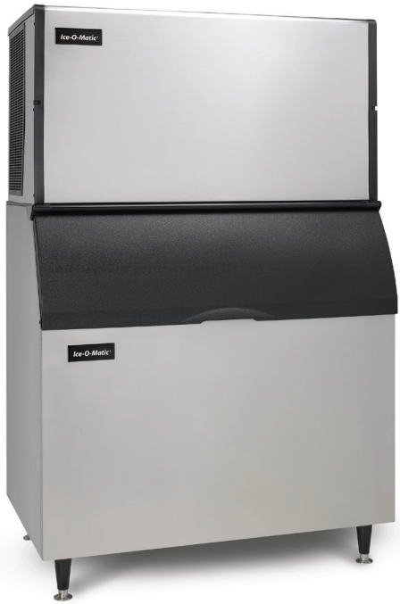
ICE2106 ON B100