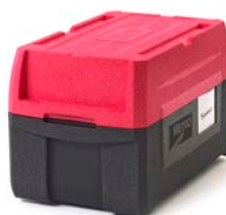
ML180XL 5 Pan Top-loader