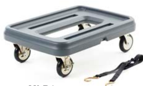
MLD1 Dolly (Includes strap)