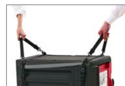
MLS1 Carrying Strap

Visit www.metro.com or call 1-800-992-1776.