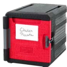
ML300 4 Pan Front-loader