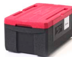
ML180 3 Pan Top-loader