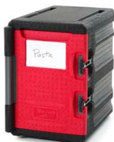
ML400 6 Pan Front-loader